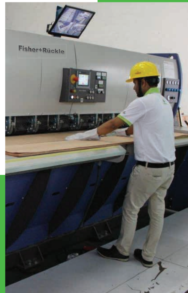
Integrated Processing Lines