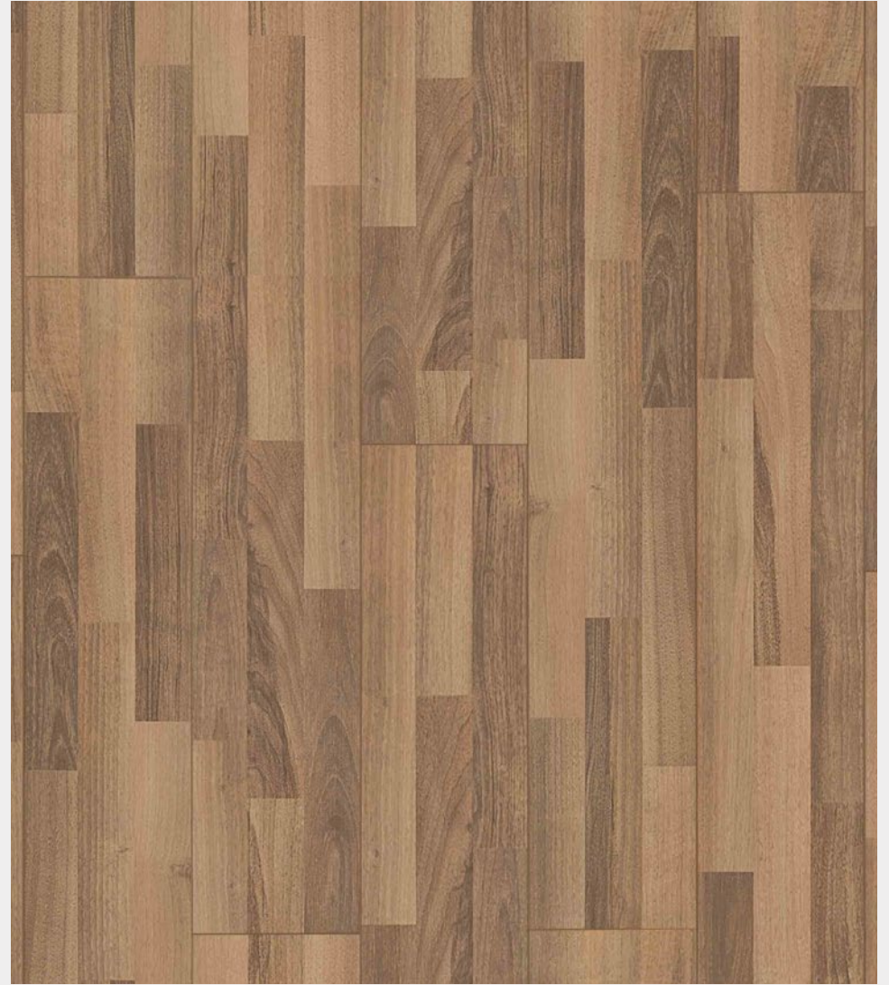
NOVA NOCE (PREMIUM) - FLP509