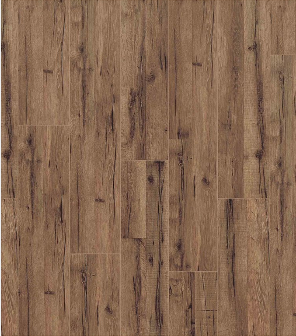
TAVERN TRAILS (PREMIUM) - FLP504