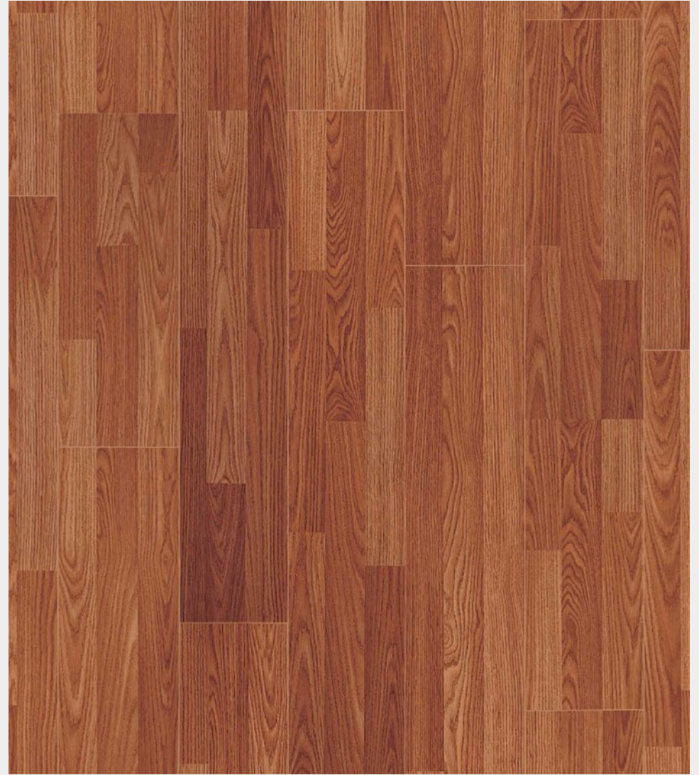
SERENGETI SHADOW (PREMIUM) - FLP503