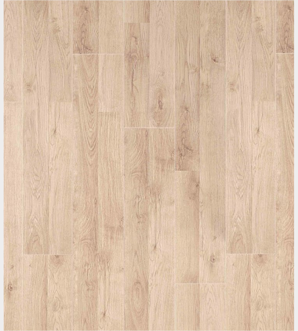
MYSTIQUE OAK - FLP507