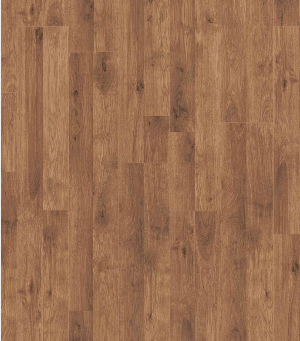
SAHARA GOLD (PREMIUM) - FLP508