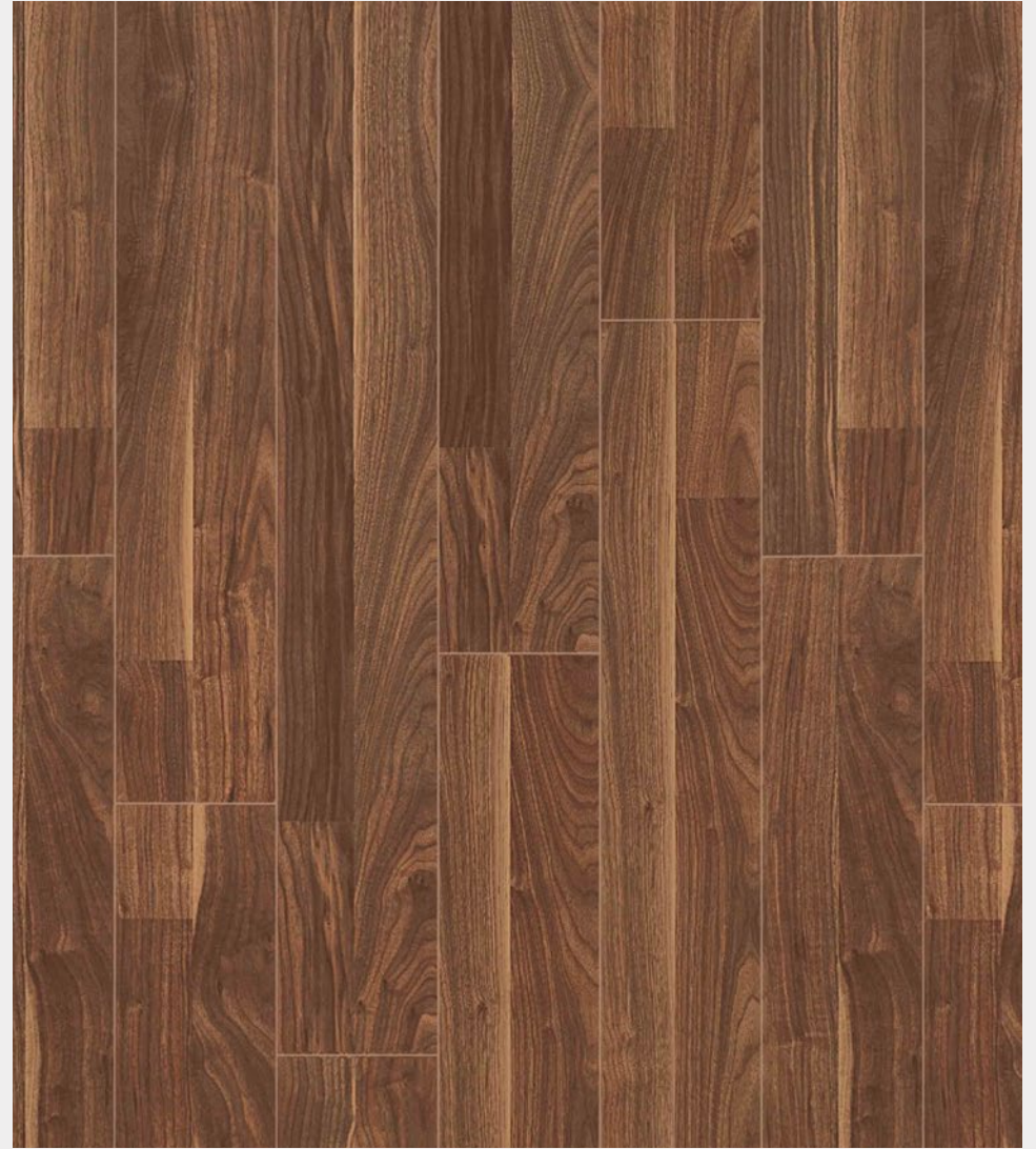
BROWNY WALNUT (PREMIUM) - FLP515