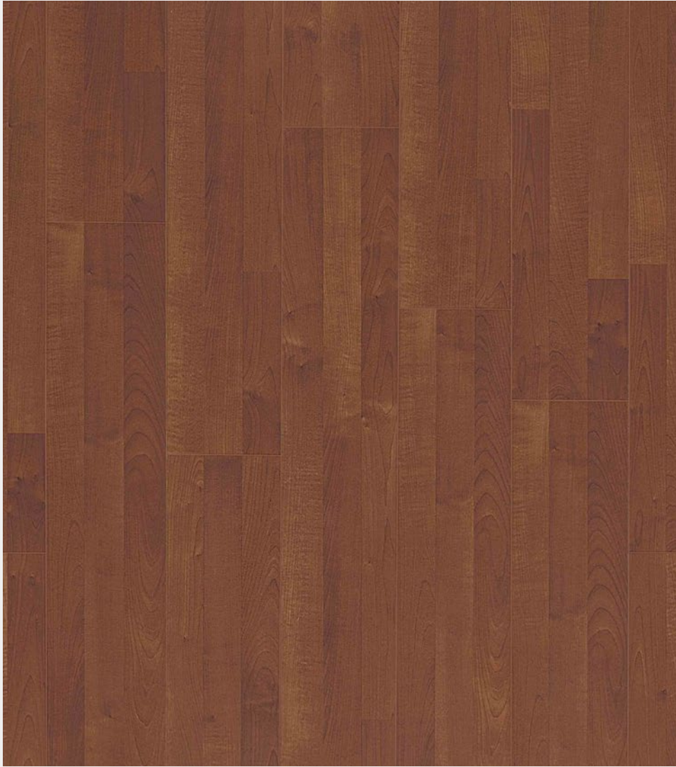
CROWNING MAPLE - FLP511