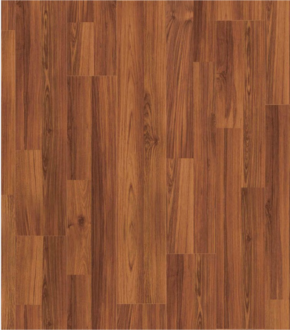
SEPIA TEAK - FLP506