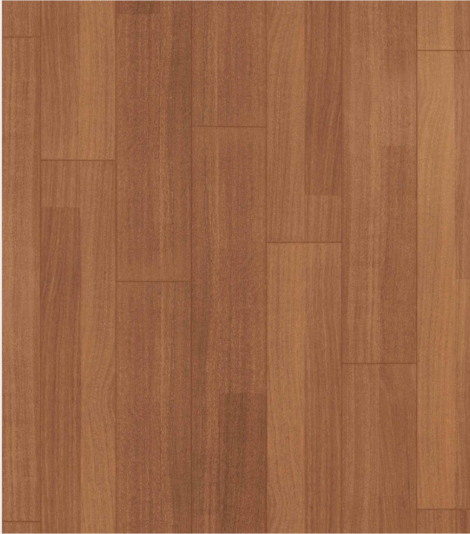
CITRUS CEDAR // FLP514