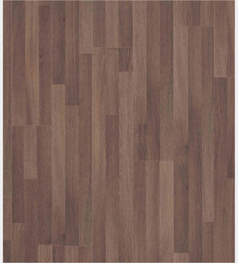
COFFEE GLORY (PREMIUM) - FLP512