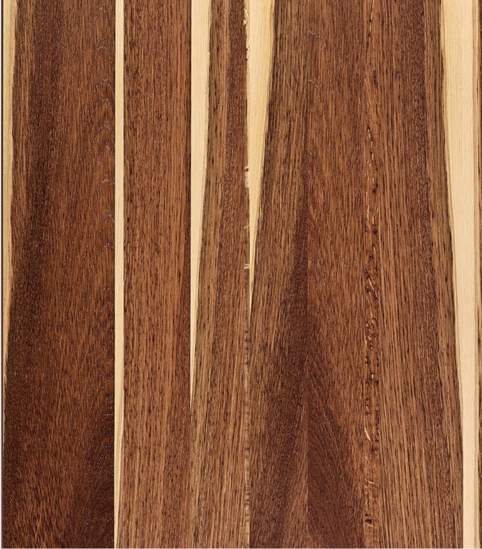
OAK COPPER - VFL P017