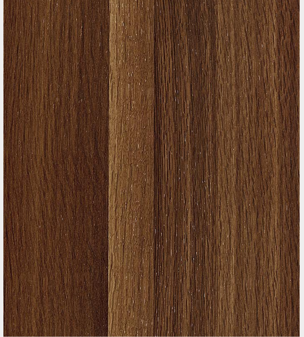
OAK SMOKED MOCCA - VFL F215