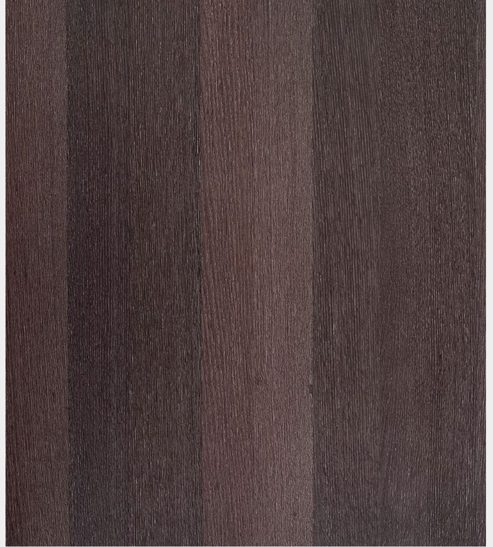
OAK ASHEN - VFL D452