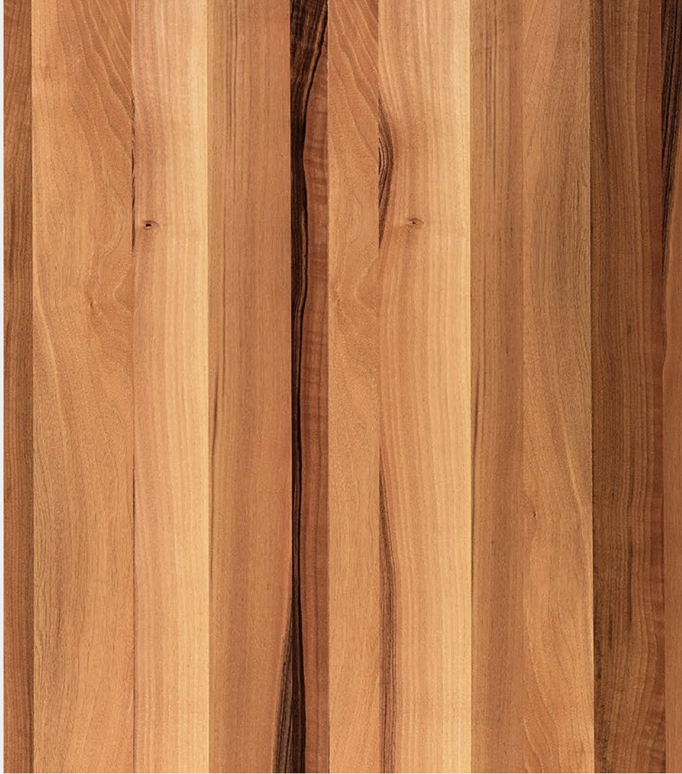
WALNUT SPOTTY - VFL P035