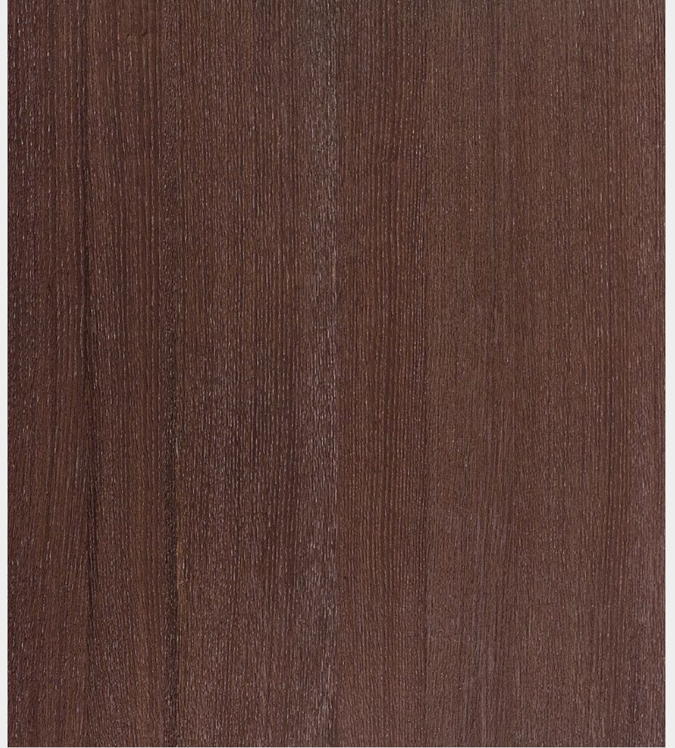
OAK SILVER-OAK DYED TAUP - VFL S401