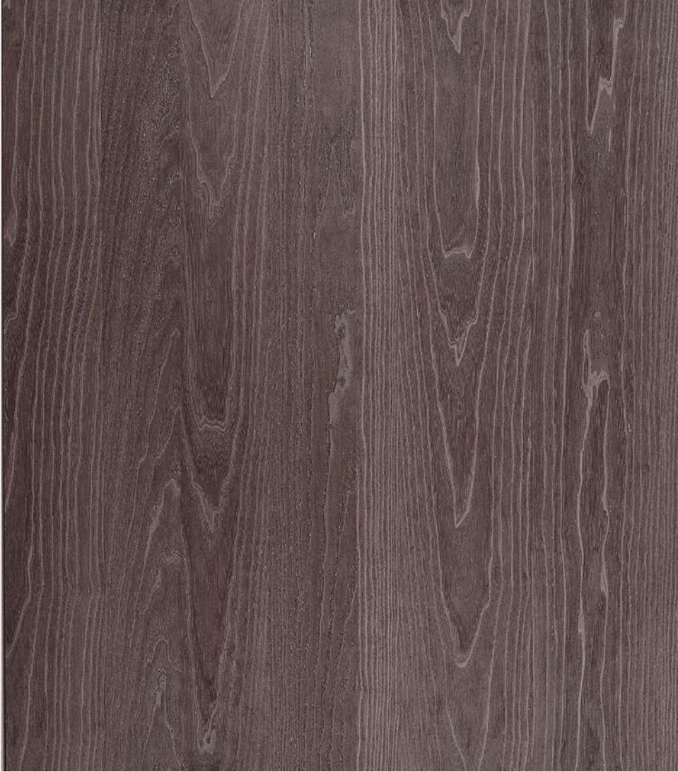
ASH SILVER - VFL D456