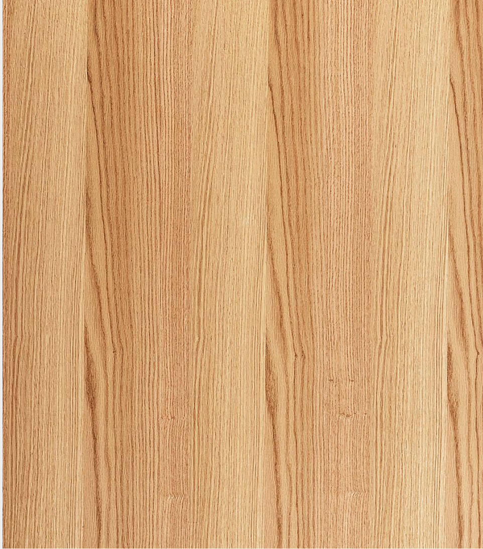
OAK NATURAL - VFL P050