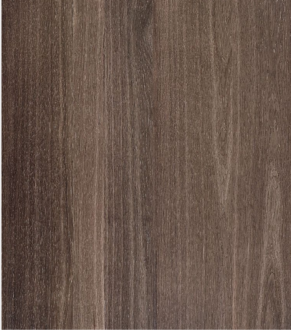
OAK SILVER - VFL D451