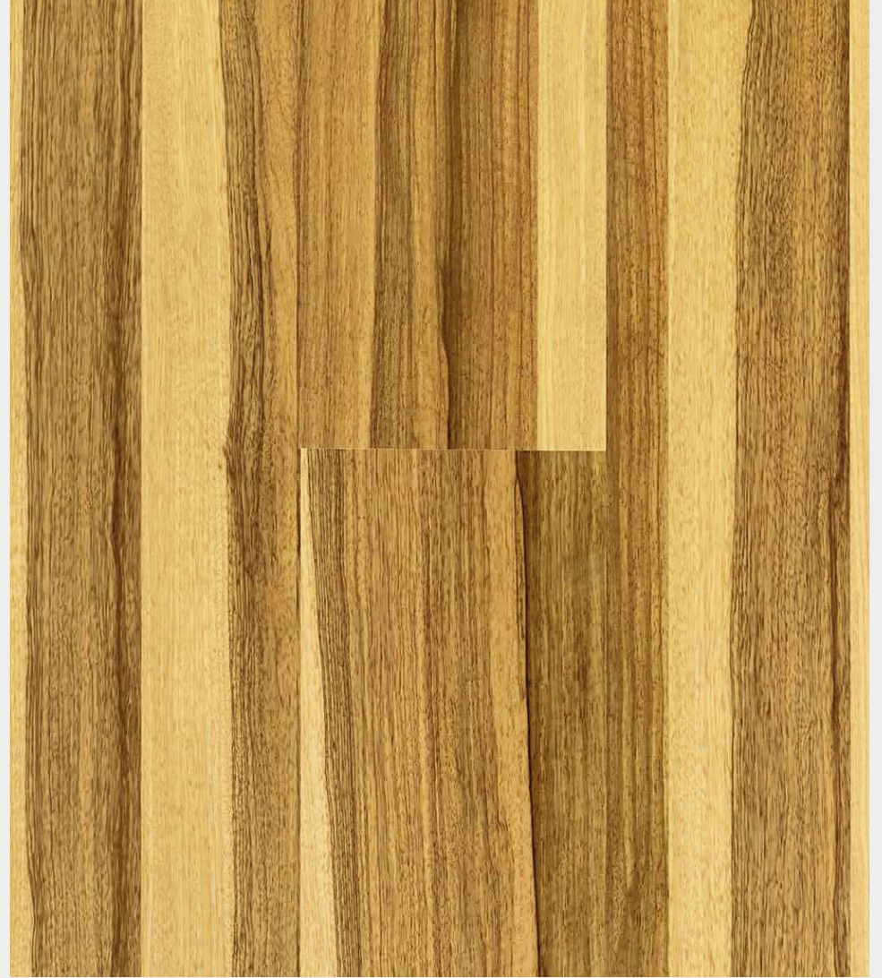
BLACK AFRA 1 - VFL L614