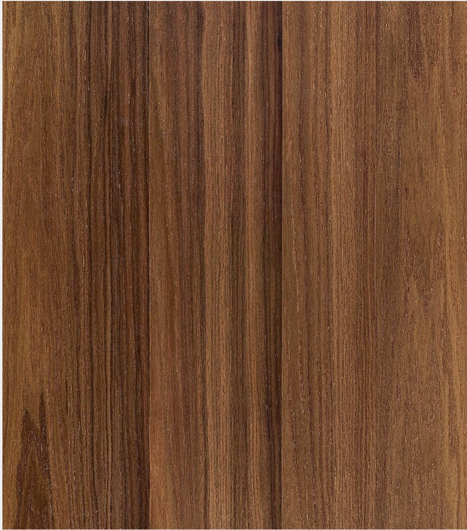
OAK SMOKED ALE - VFL F216