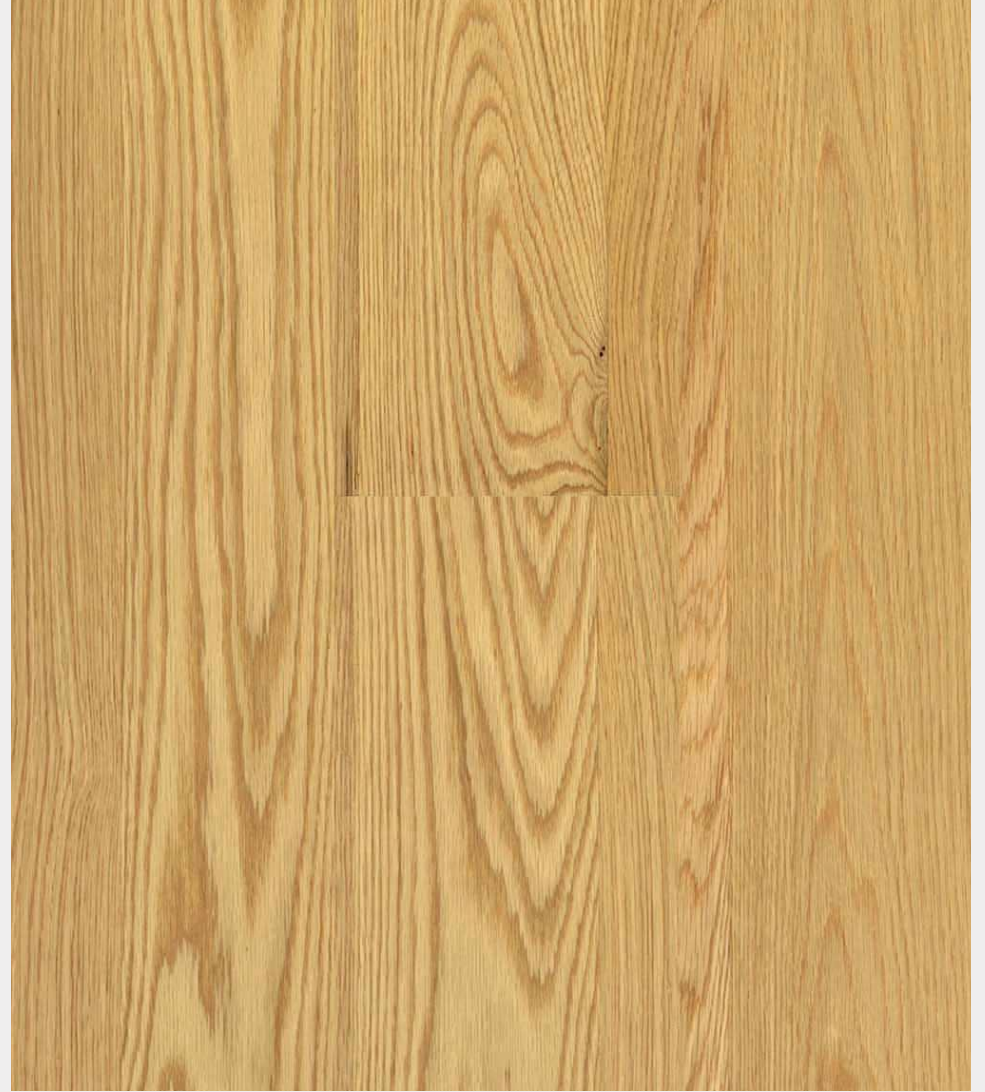
AMERICAN WHITE OAK NATURAL - VFL P014