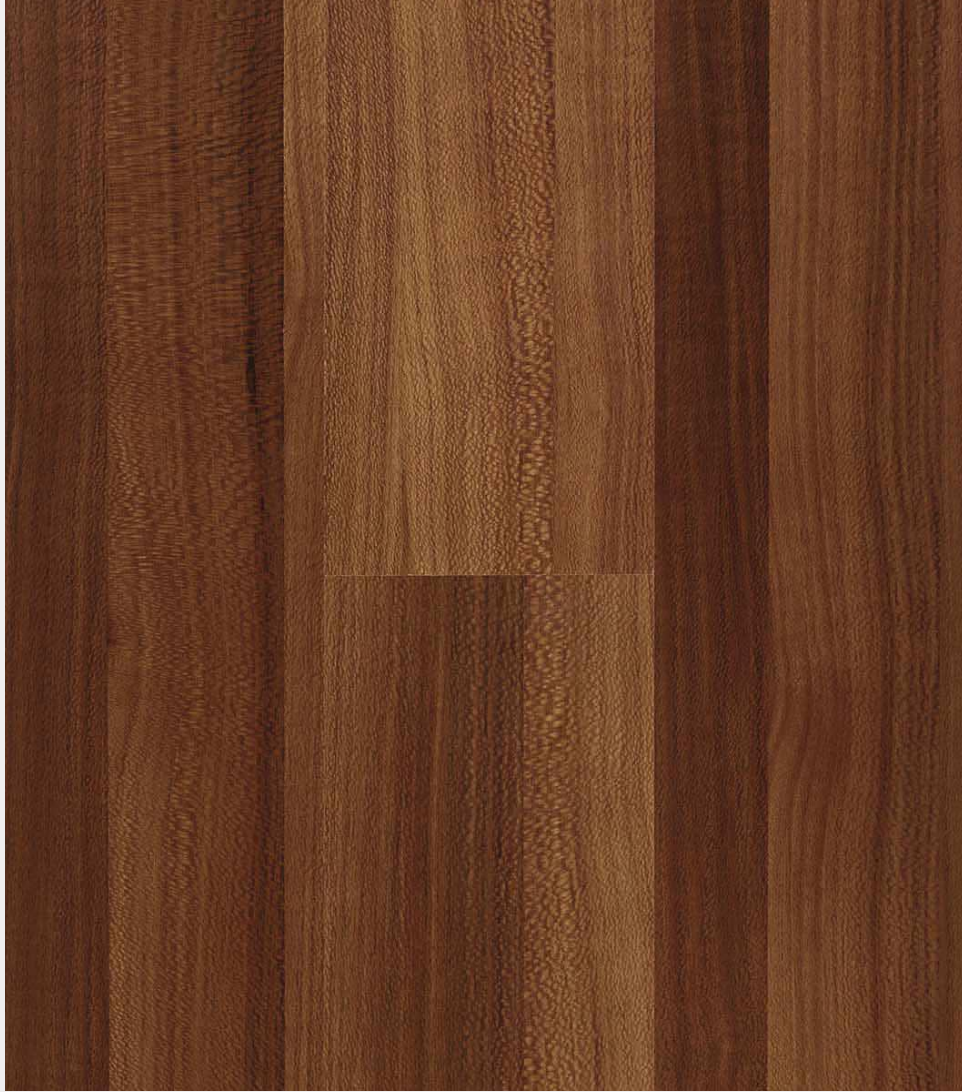
FUMED ROBUSTA OAK1 - VFL F236