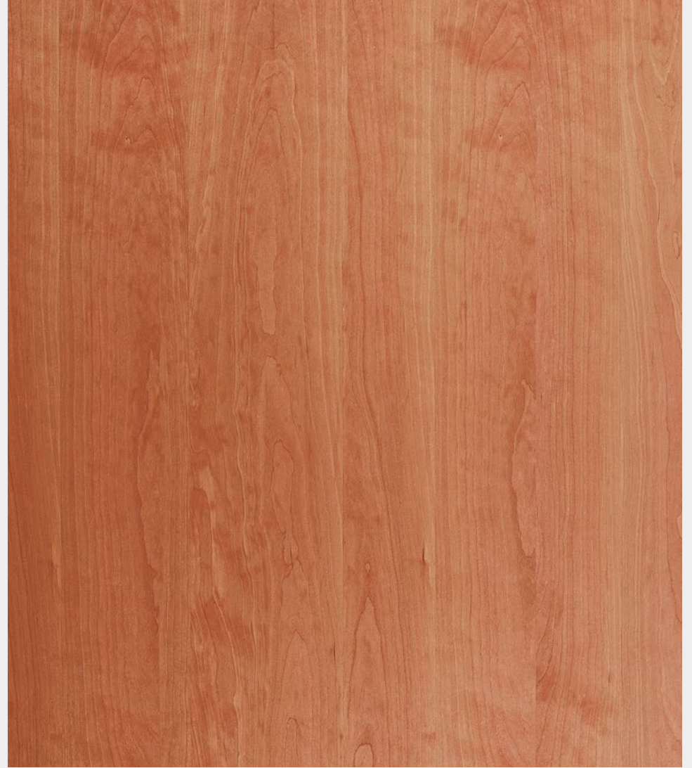
CHERRY AMERICAN - VFL P032