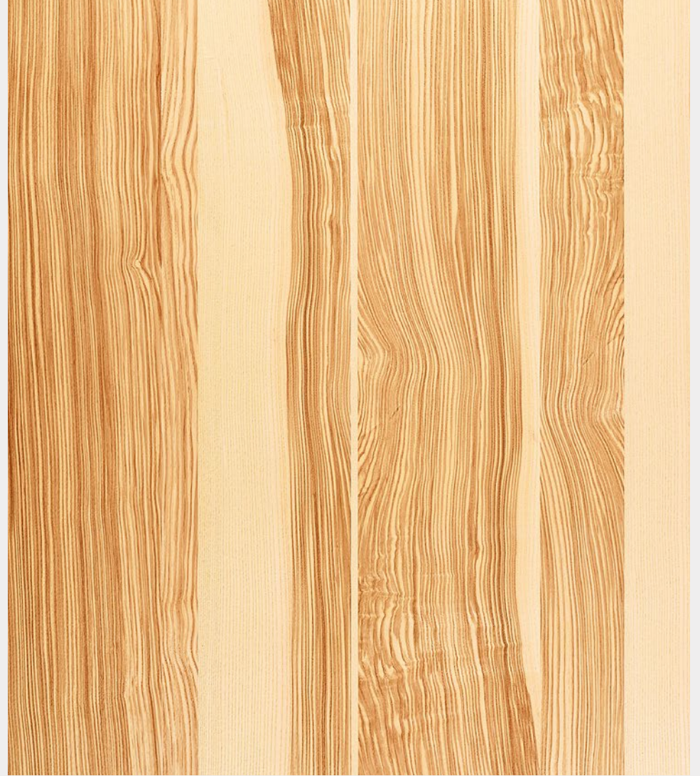
ASH OLIVE - VFL P046