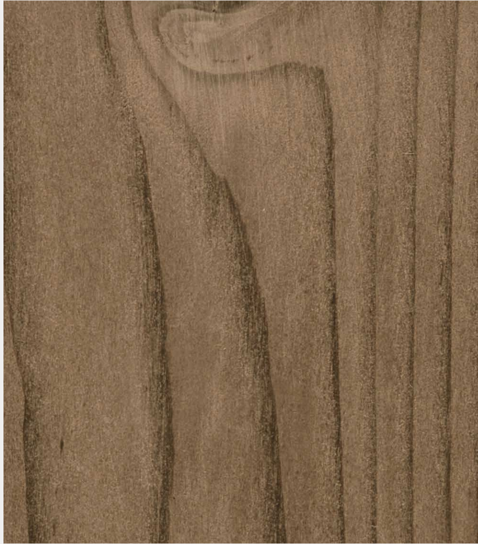
DYED KNOTTY PINE - D459