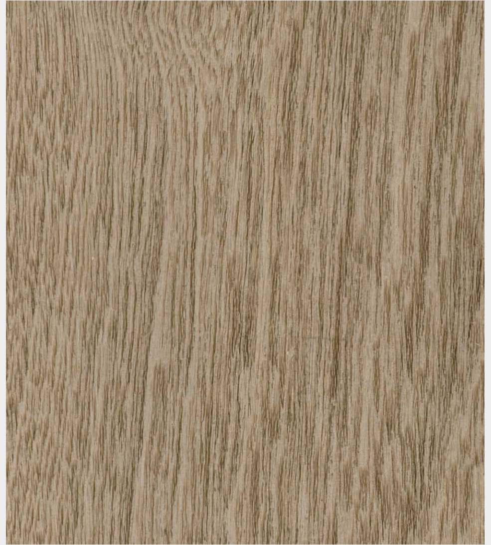
DYED SAND SUCUPIRA - D454