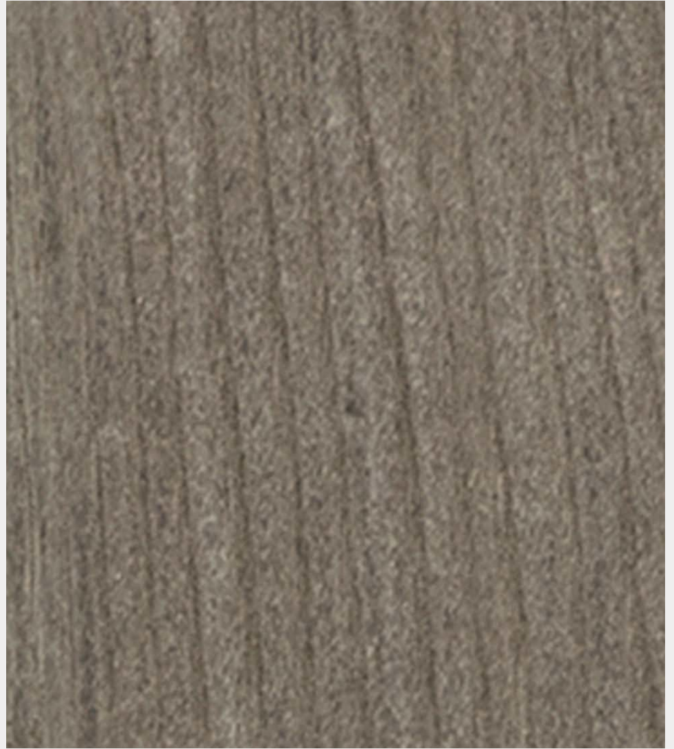
DYED ASH CROWN - 111F