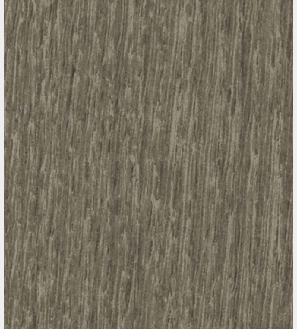
DYED OAK QTR - 112RV