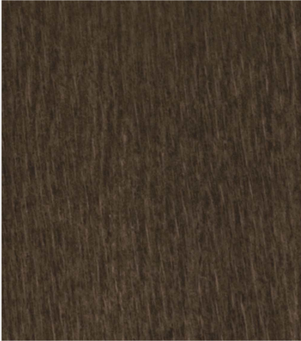
DYED OAK QTR