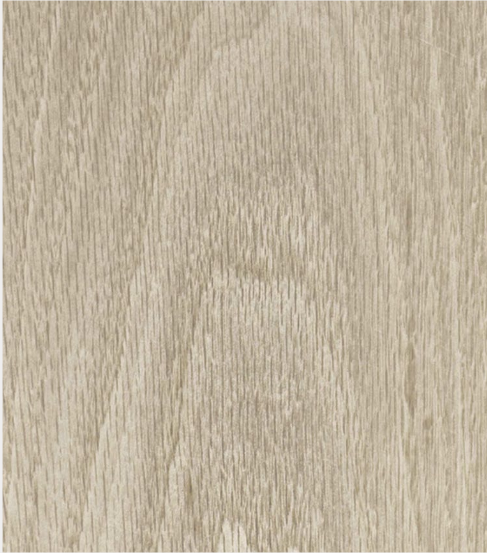
DYED OAK CROWN - 140RV