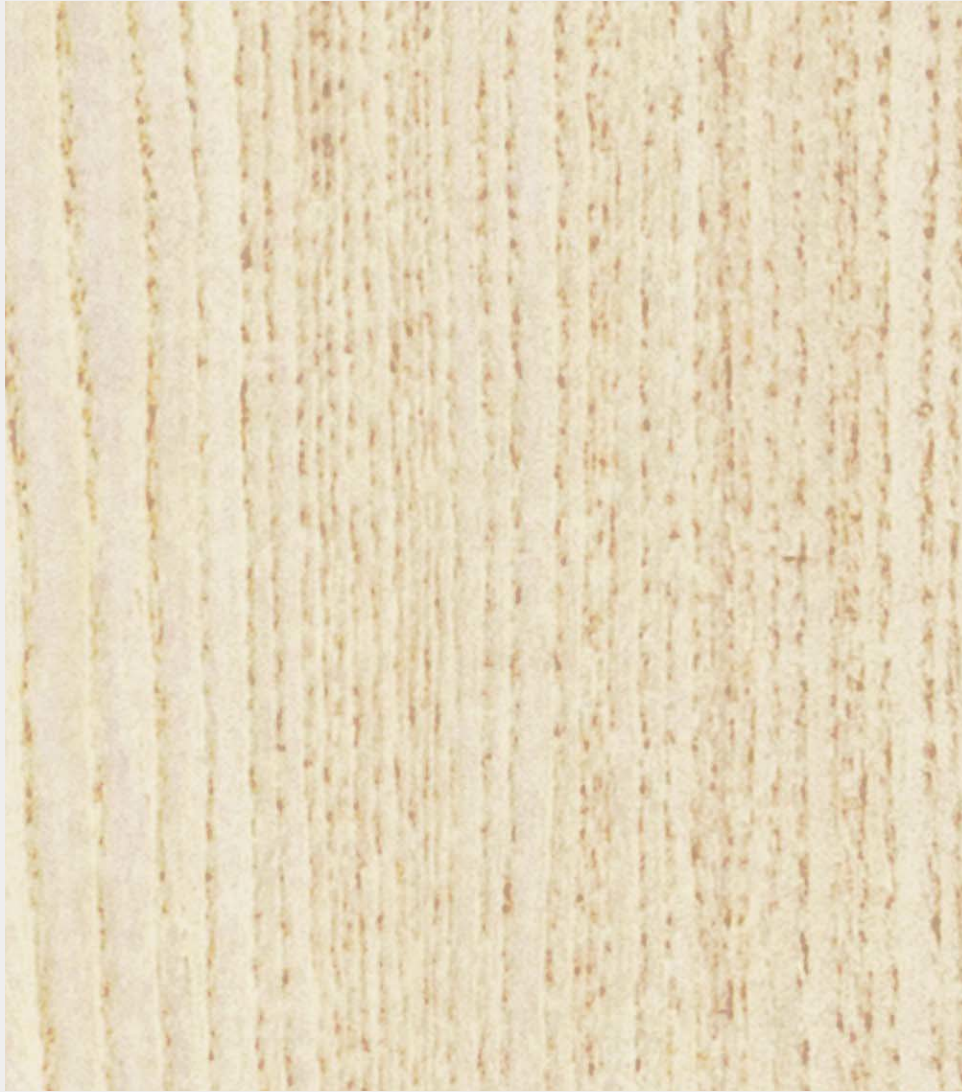
DYED ASH CROWN ARTIC